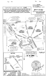
Certified Survey Map