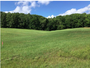
Possible Walk Out