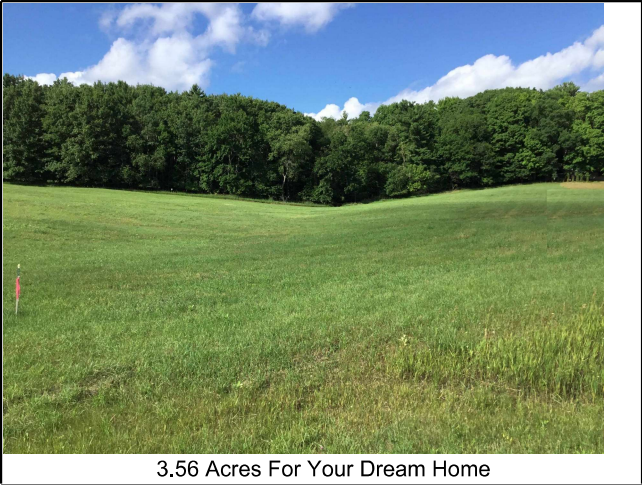
3.56 Acres For Your Dream Home

50275428 QUINTESSENCE Court Active-No Offer Lot # NEW LONDON , WI Town of Liberty 54961-7700 List Price $89,444